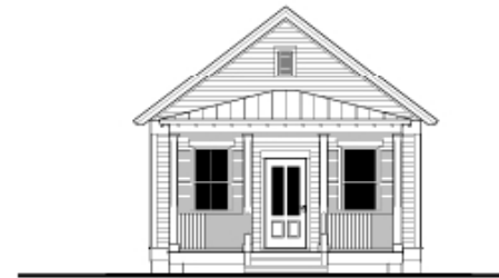
GUEST COTTAGE ELEVATION SCALE: 3/32"=1'-0"