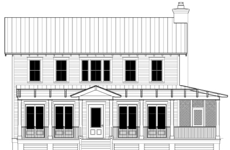
SIDEWALK ELEVATION SCALE: 3/32"=1'-0"